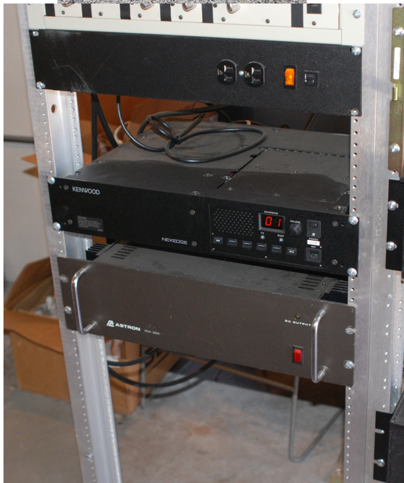
Repeater Mounting—Standard Relay Rack